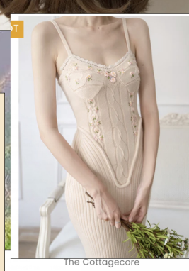
Handmade Vintage Knitted Bodycon Slip Dress $59.99 USD

A cottage-core lifestyle is characterized by simplicity and harmony, returning to agricultural roots. It often reflects a desire to escape the daily grind and a sense of nostalgia. Dresses and skirts with long sleeves and puffed sleeves are considered cottage core fashion. Classic pieces include overalls, peter pan collars, baggy linen pants, and knit cardigans.