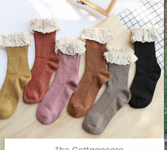
The Cottagecore Cotton Lace Socks $4.99 USD