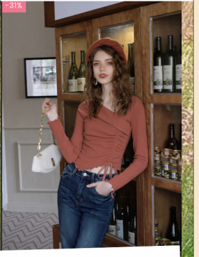
The Cottagecore Slim Fit Drawstring Knitted Shirt $46.99 USD $31.99 USD