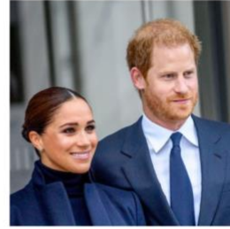
The Sussexes Had Drama with Their Netflix Director