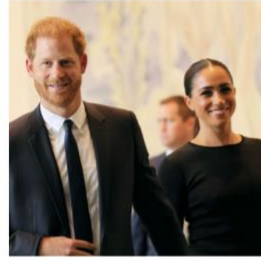
The Sussexes Are Building a...Virtual World?