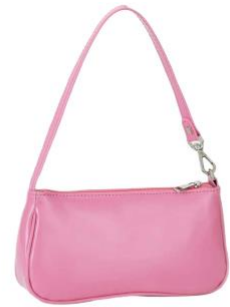
Faux Leather Baguette Bag $8

A shoulder bag with metallic details and sparkling fabric will give you a Y2K vibe.