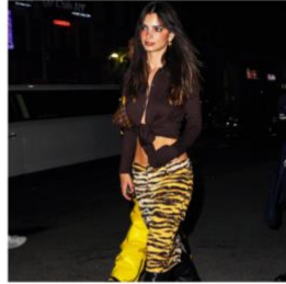
Emrata's Bringing Back Knee-Length Skirts