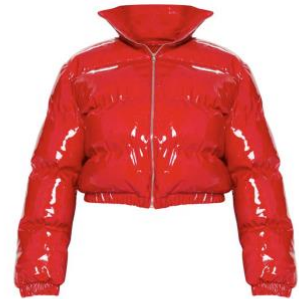
Red Cropped Vinyl Puffer Jacket $97 $47

Combine a metallic puffer jacket with flared jeans, and bright colored cardigans and tops - ideal colors include orange, pink, and light blue.